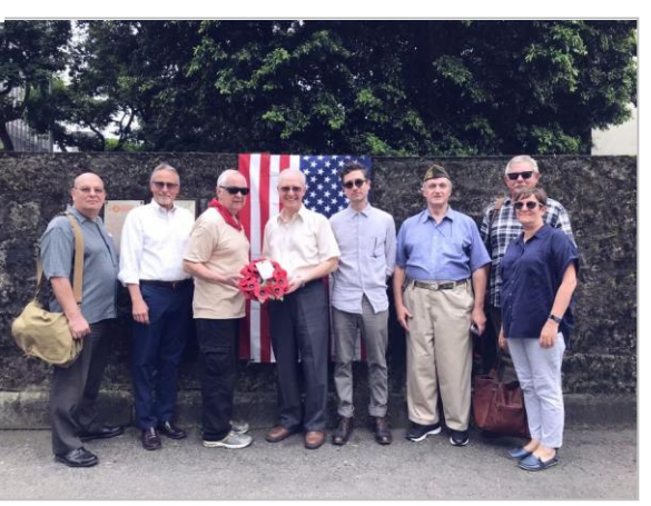
The group gathered by the American Airmen's Memorial on the old Taipei Prison wall on Memorial Day.