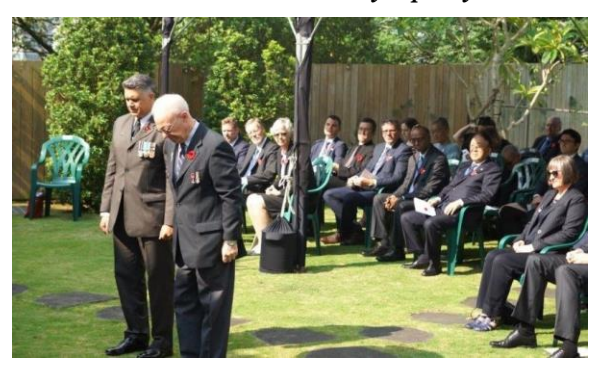
LEST WE FORGET!