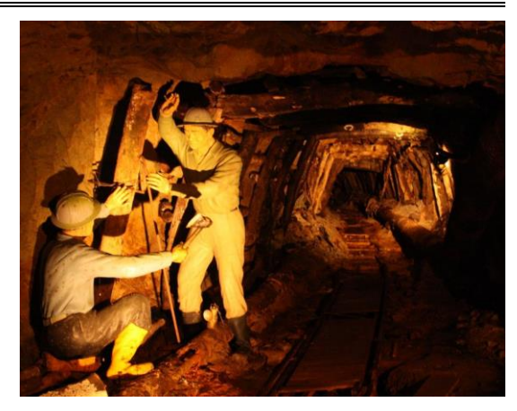
"Down the mine bonnie laddies"... Men working in the dim light of the mine Diorama in the 5th Tunnel at Kinkaseki.